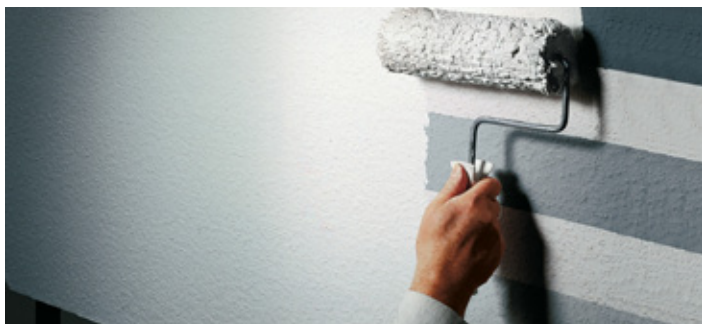
One coat generally suffices